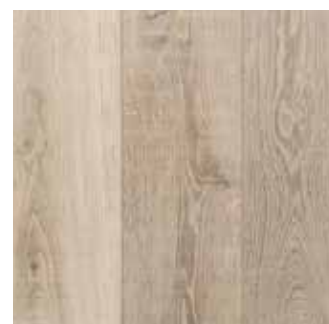
Wolf Grey ●