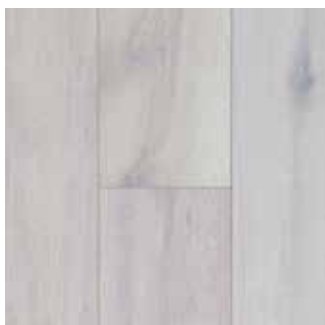
Delta Sand ●