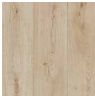
Alpine Mist ●