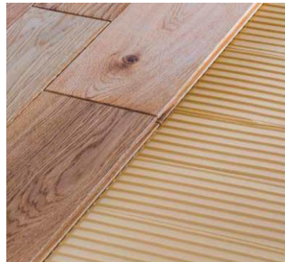
Picture 3. Clean Spills