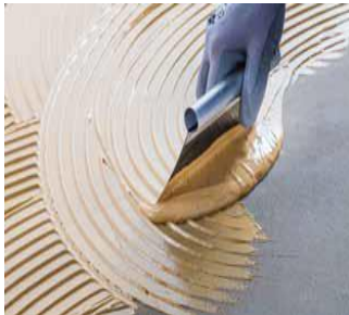
Picture 2. Plank Bonding