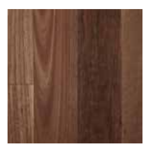
0.6mm Click Size: 1860x136x12/0.6mm Sqm: 1.771 Ctns/Pallet: 77