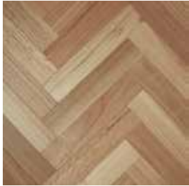
Matte, 3mm TG Size: 430x86x14/3.0mm Sqm: 0.666 Ctns/Pallet: 99