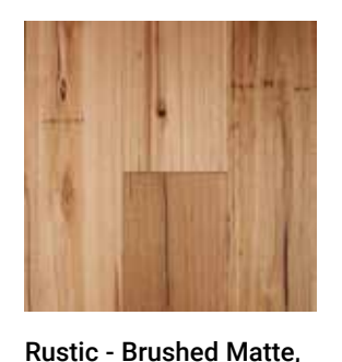
3mm TG Size: 1860x189x14/3.0mm Sqm: 2.109 Ctns/Pallet: 55