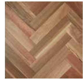
Herringbone - Brushed Matte, 3mm TG Size: 430x86x14/3.0mm Sqm: 0.666 Ctns/Pallet: 99