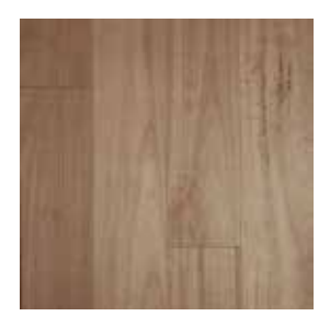
Brushed Matte, 0.6mm Click Size: 1860x136x12/0.6mm Sqm: 1.771 Ctns/Pallet: 77