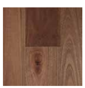
3mm Click Size: 1860x189x14/3.0mm Sqm: 2.109 Ctns/Pallet: 55