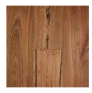
Rustic - Brushed Matte, 3mm TG Size: 1860x189x14/3.0mm Sqm: 2.109