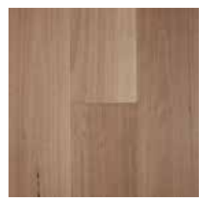
3mm Click Size: 1860x189x14/3.0mm Sqm: 2.109 Ctns/Pallet: 55