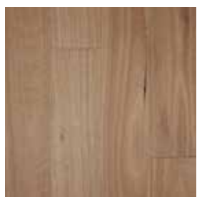
0.6mm Click Size: 1860x136x12/0.6mm Sqm: 1.771 Ctns/Pallet: 77