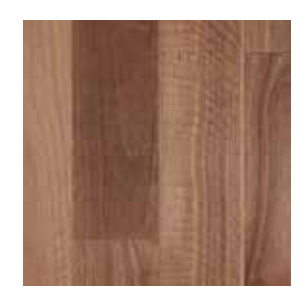
0.6mm Click Size: 1860x136x12/0.6mm Sqm: 1.771 Ctns/Pallet: 77